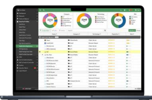
Visibility with FOS Application Signatures