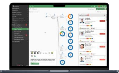
Intuitive easy to use view into the network and endpoint vulnerabilities