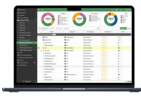
Visibility with FOS Application Signatures