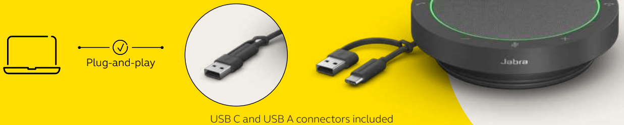
USB C and USB A connectors included

Connect the USB cable to any available USB C or USB A port on your computer. The status LED ring will light up white to indicate the speakerphone is connected and powered on.