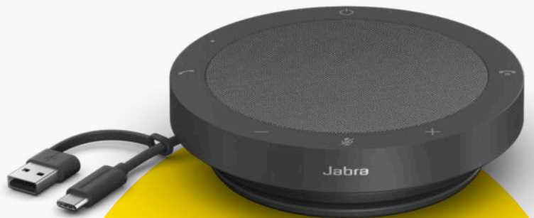
MS TEAMS & UC VARIANTS

To help take care of our planet, we consider sustainability carefully at every stage of product development. The outer casing of Speak2 40 is made with over 50% sustainable materials** and has a number of built-in parts that can be repaired or replaced. Better sustainability = longer speaker life = great calls for you and your team for years to come.