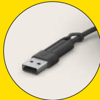
USB C and USB A connectors included