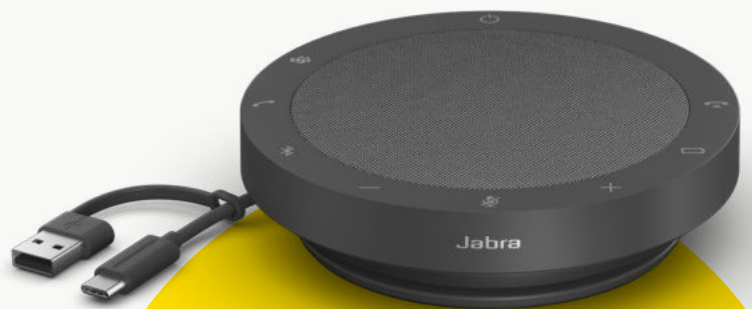
MS TEAMS & UC VARIANTS

We consider sustainability carefully at every stage of product development. The casing of Speak2 55 is made with over 50% sustainable materials**, and has a number of built-in parts that can be repaired or replaced. Better sustainability = longer speaker life = great calls for you and your team for years to come.